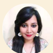
REENU Personal Assistant