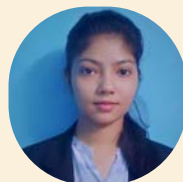
SITA Finance Executive